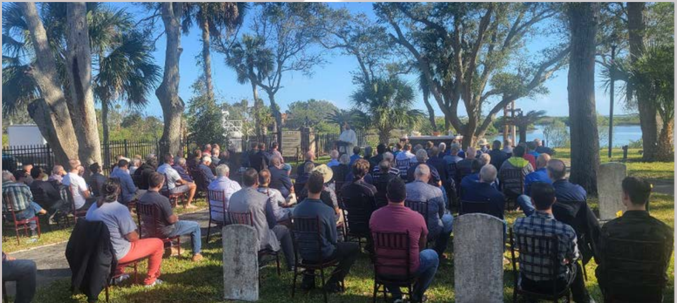
BROTHERS GATHERED AT THE RUSTIC SHRINE AT OUR LADY OF LA LECHE TO CELEBRATE MASS TOGETHER.