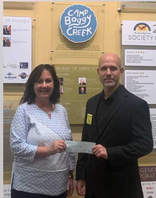
PRESENTATIONS OF $2,000 CHECKS WERE MADE TO CAMP BOGGY CREEK, L'ARCHE, PORT IN THE STORM AND BIT OF FAITH RANCH