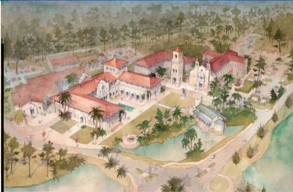
NEW CAMPUS FOR ST. JOHN PAUL II PARISH ARTIST RENDERING