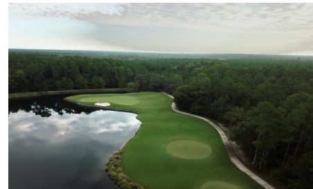
The picturesque 13 th hole at St. Johns Golf & Country Club