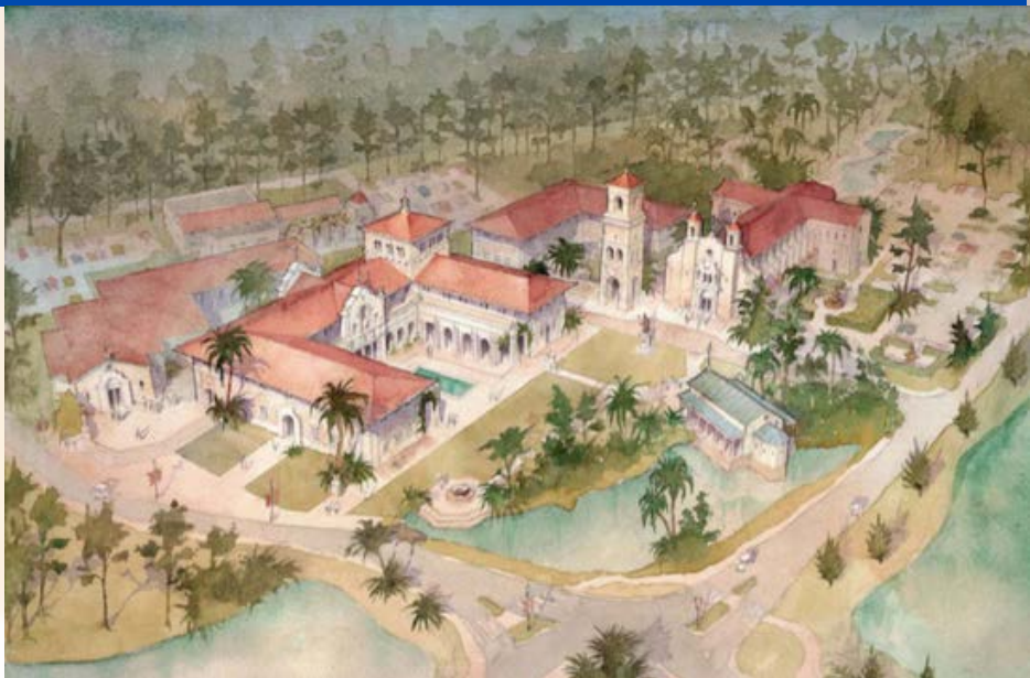
NEW CAMPUS FOR ST. JOHN PAUL II PARISH ARTIST RENDERING