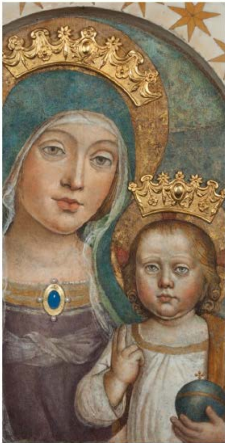
The ancient fresco of Madonna del Soccorso (Our Lady of Help) in St. Peter's Basilica was restored with the support of the Knights of Columbus to mark the Year of Faith (2012-2013).

O Mary, you always brighten our path as a sign of salvation and of hope. We entrust ourselves to you, Health of the Sick, who, at the Cross, took part in Jesus' pain while remaining steadfast in faith.