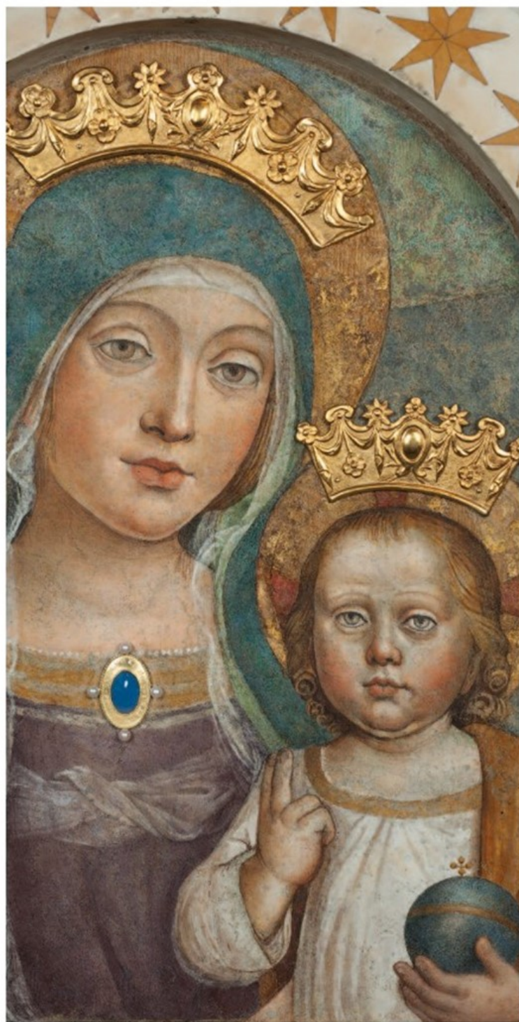
The ancient fresco of Madonna del Soccorso (Our Lady of Help) in St. Peter's Basilica was restored with the support of the Knights of Columbus to mark the Year of Faith (2012-2013).

O Mary, you always brighten our path as a sign of salvation and of hope. We entrust ourselves to you, Health of the Sick, who, at the Cross, took part in Jesus' pain while remaining steadfast in faith.